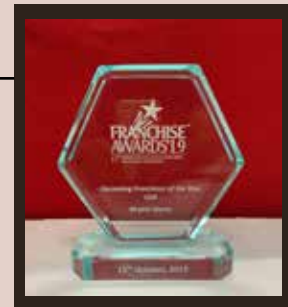
Upcoming Franchisor of the year 2019