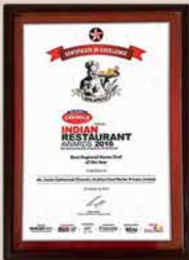
Indian Restaurant Award 2016