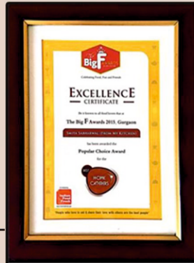
Big F Popular Choice Award