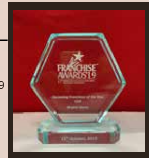
Upcoming Franchisor of the year 2019