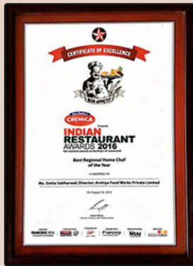
Indian Restaurant Award 2016